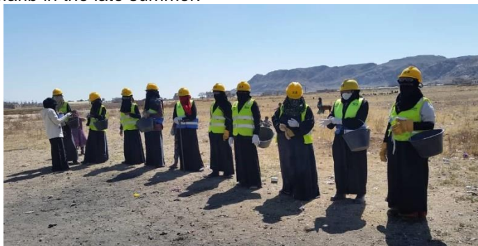
Labors working on site- installing latrines, rehabilitation of water distribution in Dhamar

Special thanks to our major donors: United States of America | Thani Bin Abdullah Bin Thani Al-Thani Humanitarian Fund | Saudi Arabia | Country-based pooled funds | United Kingdom | Japan | Germany | Qatar charity | France | Switzerland | Kuwait Society for Relief | Sheikh Eid Bin Mohammad Al Thani Charitable Foundation | Republic of Korea | Qatar | Latter-day Saints Charities | Spain | Canada | Private donors Lebanon | Private donors Saudi Arabia | Private donors United Arab Emirates | Australia for UNHCR | Cyprus | Holy See.