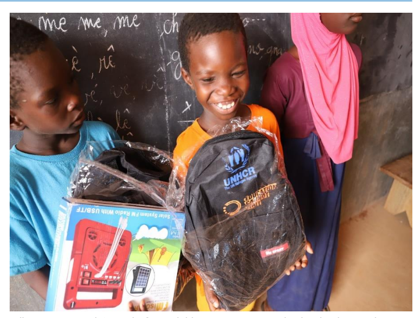
All over West and Central Africa, children are starting to back school. In Mali, classes resumed on 14 September after nearly six months of school closure.

In Mali, as part of the Education Cannot Wait project, UNHCR and its partners distributed over 1,300 solar radios and 1,300 school kits in schools in refugee and IDP hosting areas in the Gao and Timbuktu regions. In Niger , to support the return to school in September, UNHCR and its partners constructed seven emergency classrooms in Ayerou and Intikane and rehabilitated 21 classes in Telemces and Ouallam while carrying out campaigns to sensitize parents on COVID-19 prevention. In Mauritania, students in Mbera camp are attending catch-up classes to the distance-learning supplement courses and complete the previous school year impacted by COVID-19related school closures. To facilitate the return to school, UNHCR continued to