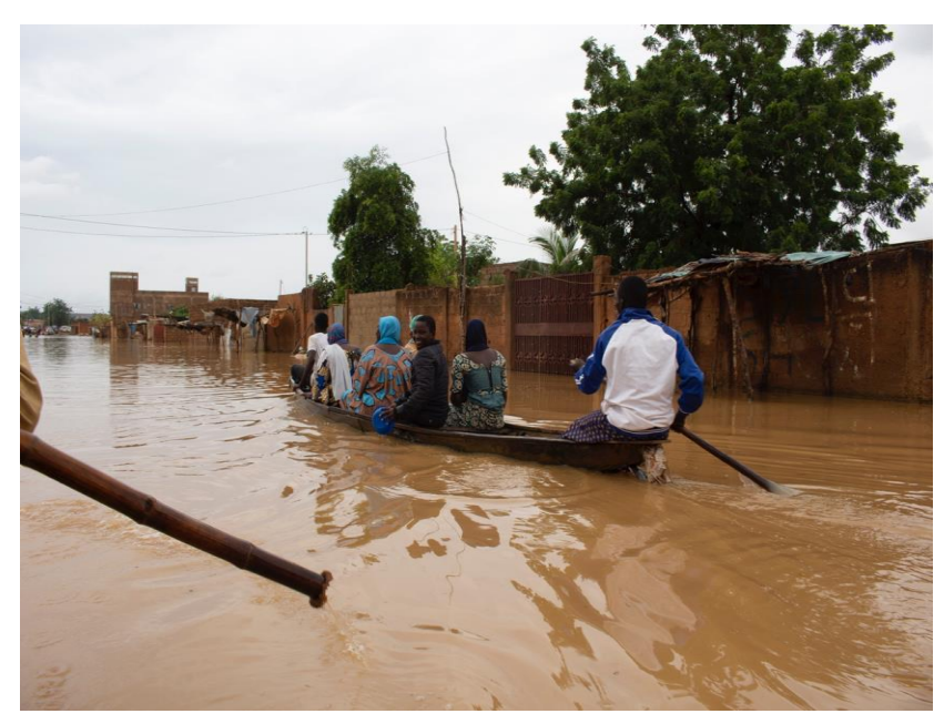
The recent rains are causing severe floods the city of Niamey and all over Niger. Since the beginning of the rainy season, the floods around the country are reported to have caused 71 dead, 90 injured and affected over 350,000 including over 9,000 IDPs and refugees.