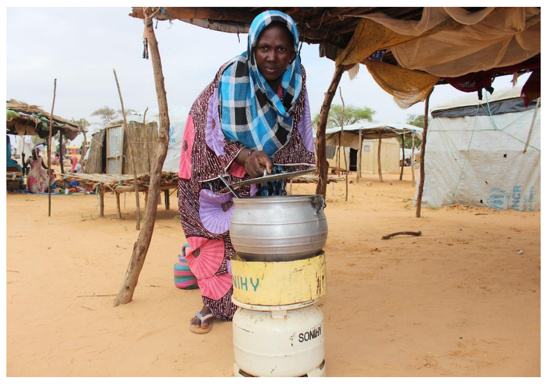
Gas kits are being distributed to refugees and IDPs in Western Niger as part of UNHCR's effort to enable them to cook while limiting their impact on the environment of the hosting areas.

direct this assistance to spontaneous sites given their more precarious security conditions and the need to prevent the risks of SGBV. In Niger , to lessen the environmental impact of displacement, UNHCR and partners have distributed 2600 gas kits enabling them to access cooking gas. UNHCR supports the initial investment for the first 6 kg bottle of gas costing USD 40.