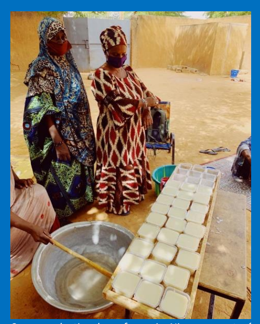
UNHCR's COVID response.

After the success of this first phase, UNHCR decided to resume the production as of 1 November with 140 beneficiaries Soap production by refugee in Niger as part of and a target production of 30.000 liters of bleach, 18.000 solid antiseptic soaps, 15.000 liters of liquid soap, 65.000 masks.