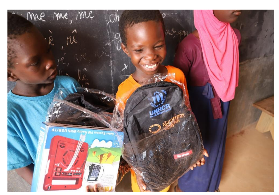
All over West and Central Africa, children are starting to back school. In Mali, classes resumed on 14 September after nearly six months of school closure.

protective equipment and assisted in the rehabilitation and the cleaning of school environments. In the countries where a complete return to school is not yet possible for health or security reasons, UNHCR continues to support distance learning through various initiatives including the distribution of solar-powered radio accompanied by school kits, to help refugee children follow school programmes broadcasted through national and community radios like in Burkina Faso, Cameroon or Mali. Since March, nearly 35,000 children have been directly supported by UNHCR across the region to help ensure continuity in education despite disruption caused by the pandemic and insecurity.