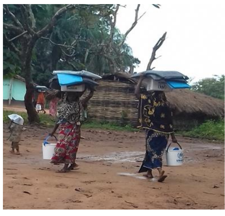
Returnees receiving shelter materials and NFIs in Bambari in October 2020.

In Central African Republic, although the number of returns has decreased significantly in 2020, due to the COVID-19 and the restrictions to international and domestic movements, refugees have been returning from neighboring Cameroon, Republic of Congo and the Democratic Republic of Congo to their places of origins. Despite the operational challenges caused by the pandemic, UNHCR has facilitated over 1,500 of these returns so far this year. To mitigate the risk of COVID-19 infections during the process, UNHCR applied strict preventive measures, which included social distancing in waiting areas and ensuring refugees would wash their hands before boarding the trucks and planes and wear masks throughout their trip. Upon arrival, health checks and temperature screening were done and the suspected cases isolated and referred to the Ministry of Health and WHO for adequate treatment. UNHCR has also supported the reintegration of the