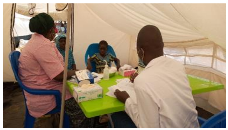
The newly established mobile clinic in the Sahel provides much needed primary health care to IDPs, refugees and host community and a strengthened response to cases of SGBV in the Sahel.

on SGBV. UNHCR Mali undertook a Rapid Gender-based violence (GBV) Assessment. The first phase completed in August 2020, consisted of a desk review and consultation with stakeholders to gather relevant data on the GBV and protection context in the four targeted areas (Cercle d'Ansongo (Gao), Cercle de Douentza et la commune Sokoura (Mopti), Cercle de Ménaka (Menaka) and Cercle de Gourma-Rharous (Tombouctou), as well as information on existing legal provision and frameworks. The second phase of the assessment was scheduled in September 2020 and will consist in key informants' interviews to complete the