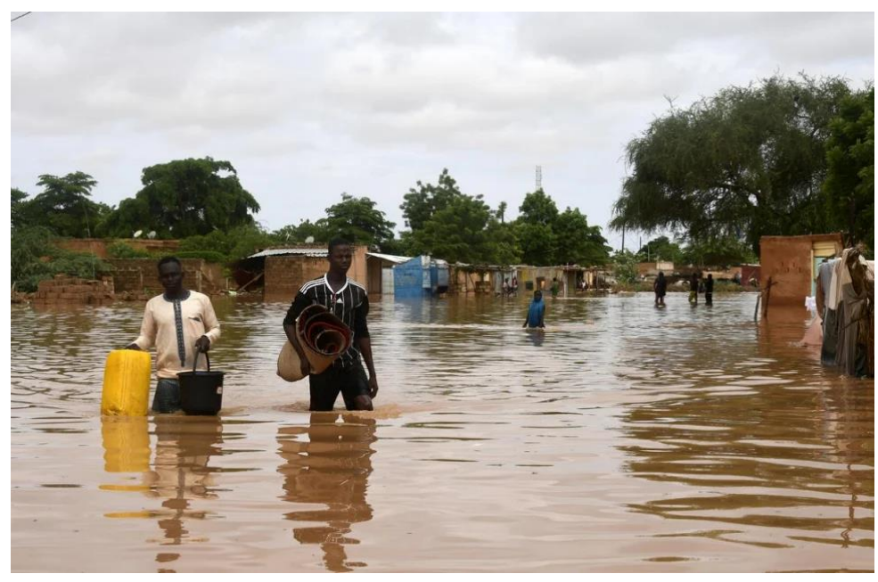
People carry their belongings in a street flooded by the Niger River in the Kirkissoye neighbourhood in Niamey, Niger, on August 27, 2020.