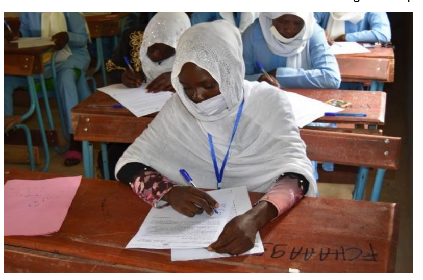
Grant funded project, the construction Refugee Baccalaureate candidate at Farchana in Chad.

In Mali, as part of Japan's Emergency Grant funded project, the construction