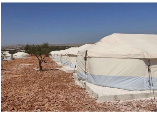
Gravelling of tents in Idleb.

With the spreading of COVID-19 in the region that has added to the ongoing hostilities, inadequate shelter conditions and a deteriorating economic situation, in 2020, UNHCR provides basic assistance and protection services to IDPs and conflict-affected vulnerable host community members in north-west Syria under the cross-border operation from Gaziantep, Turkey. Following the renewal of the UN Security Council Resolution that allows for the delivery of cross-border humanitarian assistance in July 2020, UNHCR has been updating its programming and has been coordinating with its partners, as well as the other humanitarian actors, to continue responding to the humanitarian needs of the population in the region.