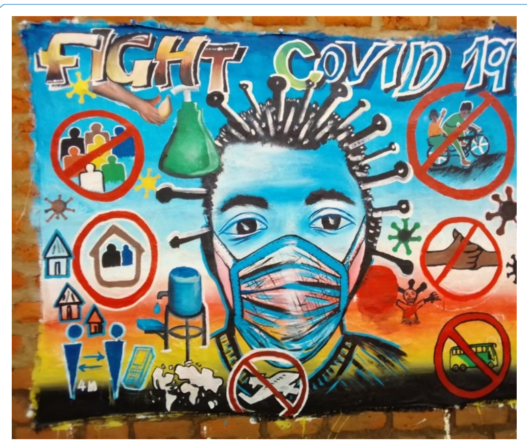
A canvas painting illustrating COVID-19 preventative measures.