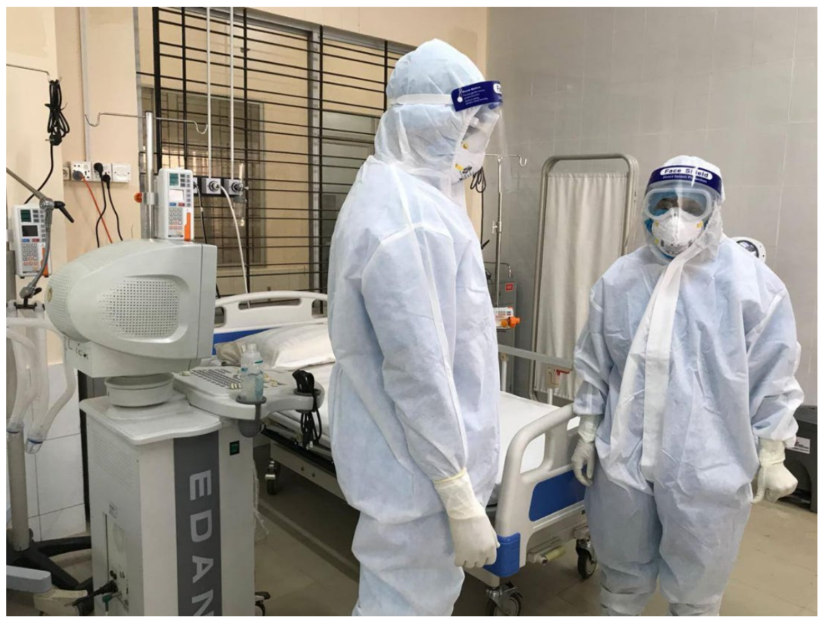
Health staff working in District Sadar Hospital in Cox's Bazar, who will be working in a newly expanded ICU and HDU wards supported by UNHCR. The expanded facilities were launched on 20 June.