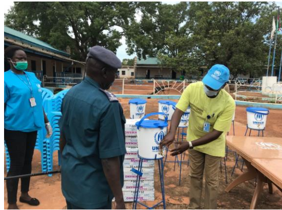
UNHCR demonstrates how to use the handwashing stations during a donation of COVID preparedness items to one of the Wau prisons.