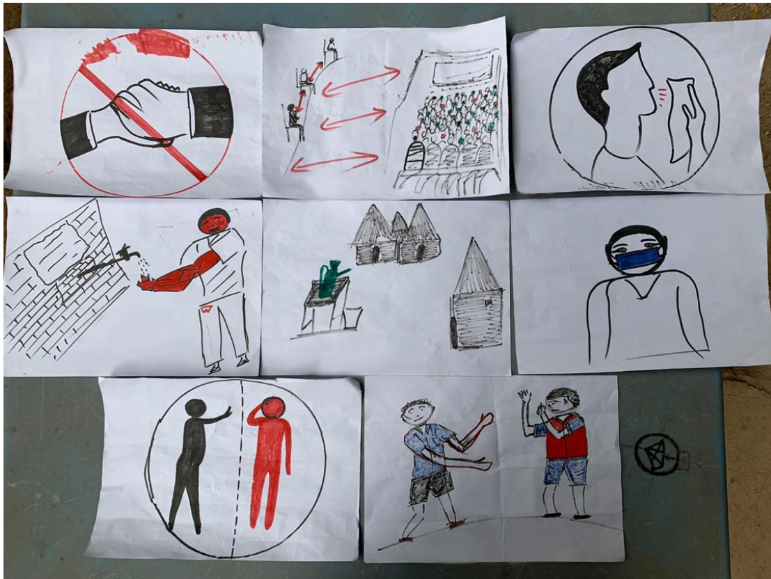
The finalists of a children's COVID-19 awareness drawing contest in Malakal POC. The contest was developed to encourage engagement with the messaging. The drawings will be used during awareness raising activities.