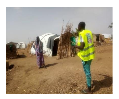
Pic 1; Community relay in the Minawao camp, carrying out door-todoor sensization on preventing spread of Covid-19.