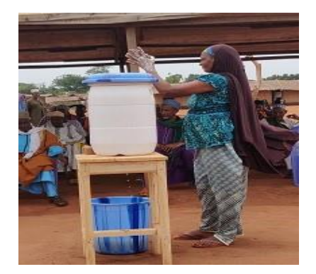
Pic 2; Demonstration on effective handwashing for community leaders in Timangolo, East region.