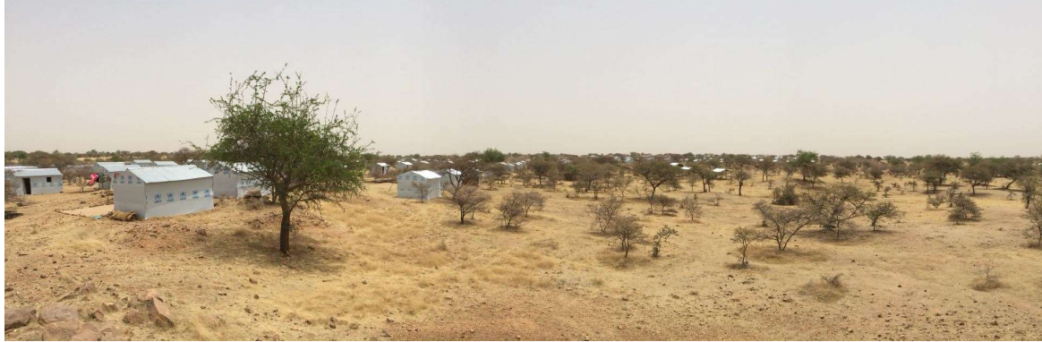
Kouchaguine-Moura Camp @UNHCR

Charlotte Pinet – Emergency Reporting Officer – pinet@unhcr.org / +235 68 59 30 08