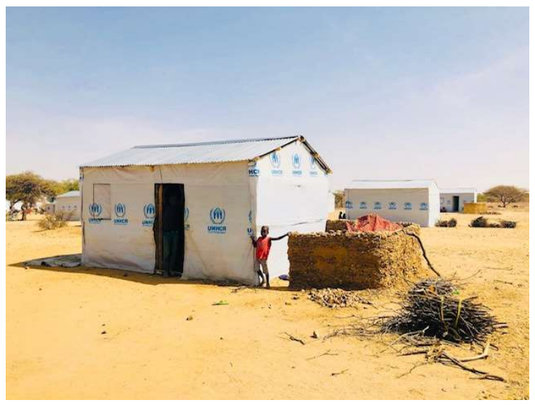
Family shelter in Kouchaguine-Moura

On 19 March, thanks to its private partner, UPS Foundation, UNHCR airlifted 93.5 tonnes of emergency aid for Sudanese refugees. The airlift included 10,000 blankets, 12,000 jerry cans, 12,000 mosquito nets, 10,640 plastic buckets, 6,000 kitchen sets, 4,000 sleeping mats, 2,000 solar lamps and 2,000 plastic sheets, in addition to one ambulance. Some of these emergency relief items will be distributed to the families who have been relocated to Kouchaguine-Moura.