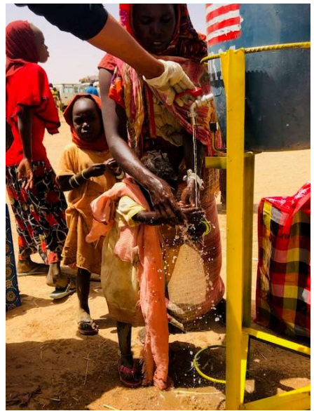
Handwashing point at the border area

Simultaneously, in close collaboration with its Government counterparts and humanitarian partners, UNHCR has been working around the clock to ensure family shelters, latrines, showers, boreholes and other basic services are ready in the camp to receive new refugees .