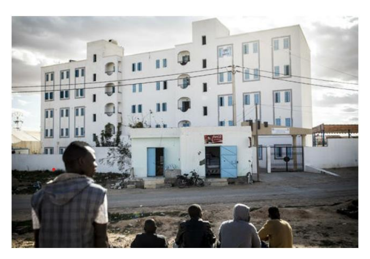
Asylum seekers sitting in front of Ibn Khaldun shelter, in Medenine town, southern Tunisia