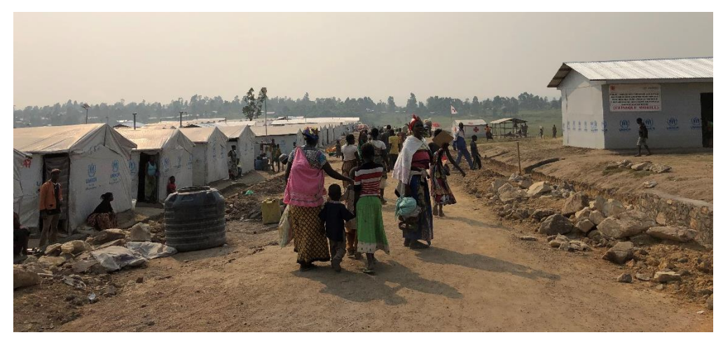
Displaced population at the Kigonze IDP site in Bunia (Ituri Province), after having been transferred from the neighbouring General Hospital site.