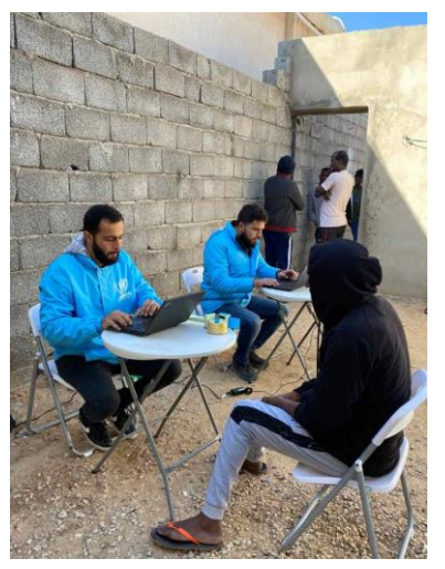
Registration of POCs at the Souq al-Khamis detention centre in Mistrata.

UNHCR continues to register persons of concern (POCs) through its Sarraj Registration Office in Tripoli. Last week, UNHCR registered 364 individuals mainly from Sudan but also including individuals from Syria, Eritrea, Palestine, Somalia, and Ethiopia. Registration is taking place this week at the Souq al-Khamis detention centre in Misrata (190 km east of Tripoli) over several days. On 23 January, the registration team also carried out registration and verification activities at the Al Safwa clinic in Misrata city.