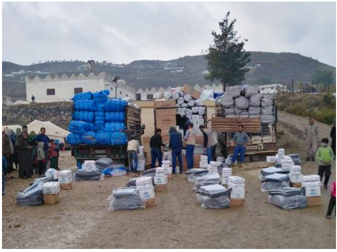
Distributions of tents and winter NFI kits in Aleppo and Idleb