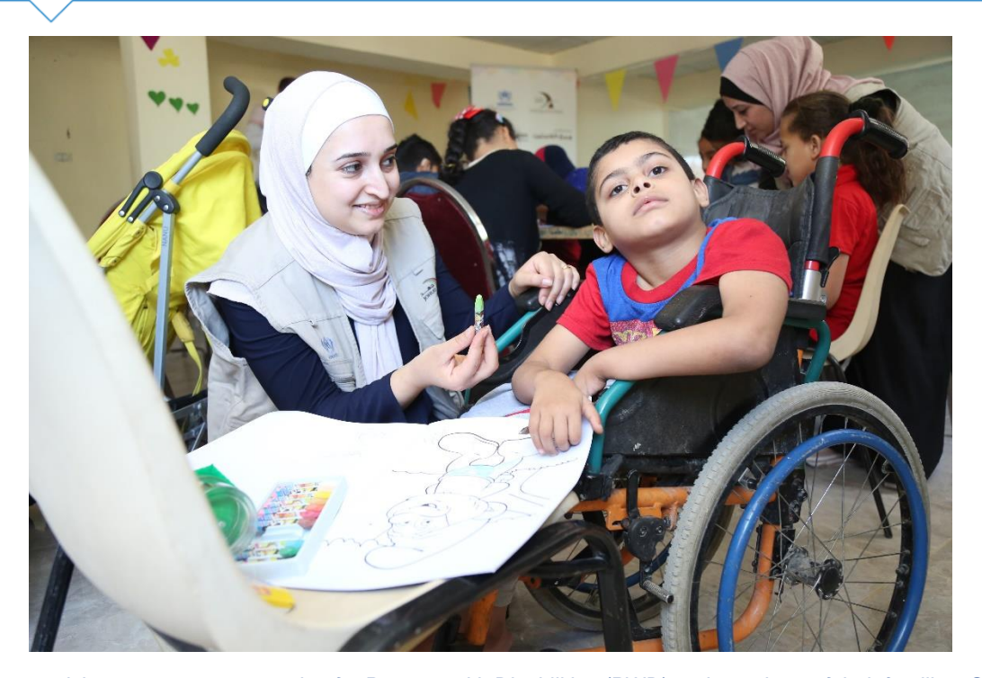
Awareness activity: an awareness session for Persons with Disabilities (PWD) and members of their families.

These networks help to provide a timely response in a critical time as well. For instance, the CSCs' networks are the most reliable and effective mechanism to identify the affected families in winter-time emergencies. Finally, the independence that is given to CSCs in the engagement process makes them more responsive and innovative, as they are able to plan and implement the activities more independently and equally, in consideration of the communities' needs.