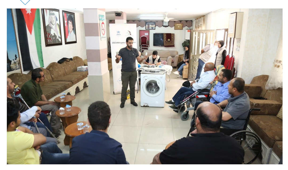
Training activity: Maintenance of washing machines, Sweileh CSC.