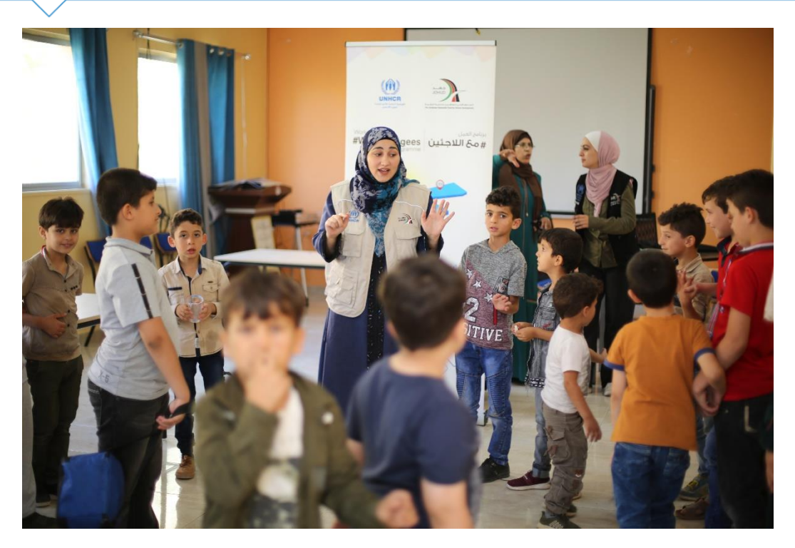
Cultural activity: "Hakawati" Storytelling, Tafilah CSC.