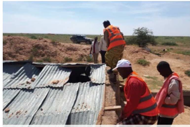
Site maintenance committee rehabilitating a public berkhad in Fadhigaab, Western Sanaag Photo/ACTED/November 2019

Site verification was completed in Galkayo North. There are currently 33 IDP sites hosting 62,453 residents. Compared to the site verification exercise held in December, the number of IDP sites has remained the same while the population has reduced by 2,721.