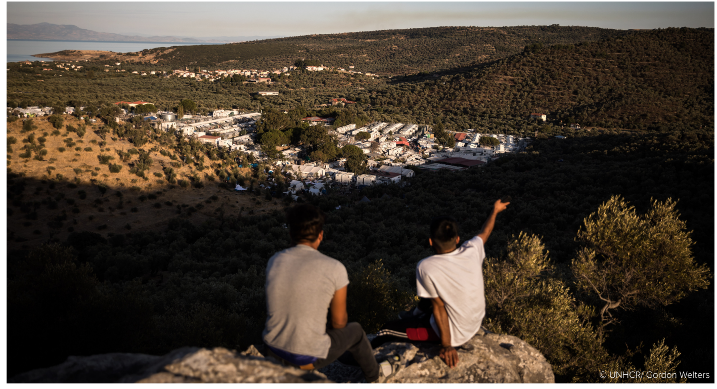
Asylum-seekers face dangerously overcrowded conditions in Moria. Asylum-seekers prepare to spend the night in camping tents in the olive grove adjacent to Moria, Lesvos, Greece.