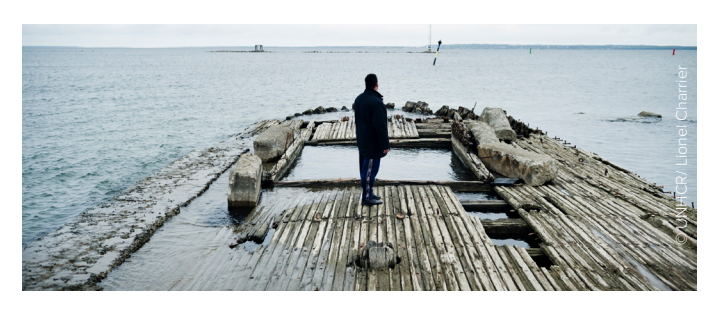
Estonia. Portrait of a stateless person

More information about the run-up and the outcome of the High-Level Segment can be found in this quarterly Campaign update.