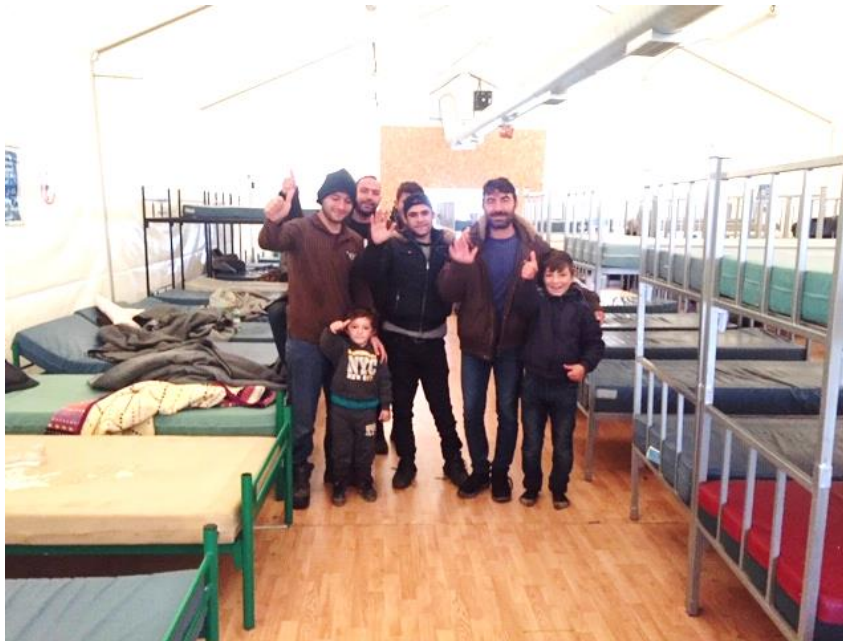
New arrivals from Syria in South Serbia, ©UNHCR, October 2019