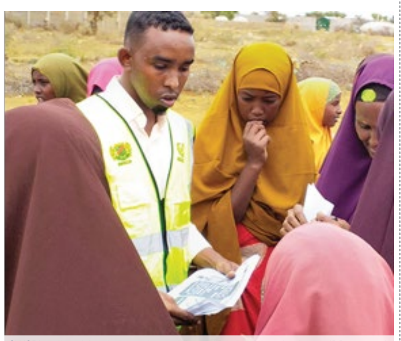
SWCRI staff explains the use of complaint and feedback mechanism to IDP women in Baidoa.

Site development of the public site in Baidoa is ongoing. Land is being prepared for the relocation of 2,000 additional households by the end of the year.