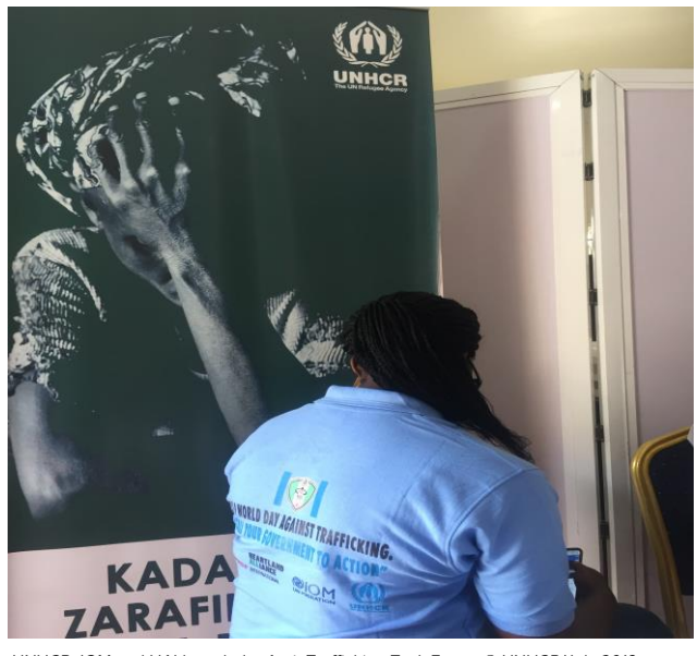
UNHCR, IOM and HAI launch the Anti- Trafficking Task Force.