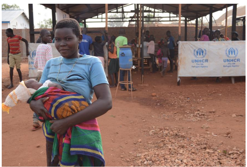
South Sudanese refugees newly arrived in Ituri Province.