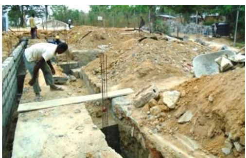
(L) Kitchen construction site briefing meeting with all key stake holders: UNHCR, LRRRC, AIRD and Beneficiaries. (R) Ongoing construction of 2 class rooms at Bahn camp at foundation stage.