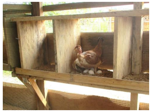
(L) LARO Agriculture Field Technician shares, together with UNHCR, techniques to plant their crops in Karla Village to host community members. (R) Interior of one of the five poultry structures ran by refugees in PTP Camp.