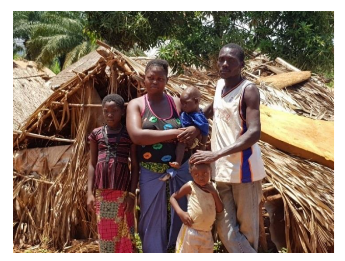
CAR refugees living in difficult conditions in a a makeshift settlement in the village of Ndu, Bas-Uele. This village alone is home to 15,000 refugees.

Prior to the 2017 influx, over 100,000 CAR refugees had already been living in DRC, some since 2013, with over 59,000 living in five camps. The assistance in camps is more comprehensive than that provided outside of camps. However, serious gaps remain due to a lack of funding, notably in health, self-reliance and non-food items. For out-of-camp refugees, UNHCR's approach has focussed on advocacy for protection, community-based protection, and support to basic local infrastructure (health centers, boreholes, schools), benefitting refugees and Congolese host communities alike.