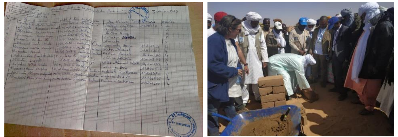
Enrolment book of the primary school of Mangaize refugee camp, following a mobilisation campaign to enroll Malin refugees in school (left) and laying of the "first brick" for new school infrastructure in Intikane, in the Tahoua region (right).

UNHCR education partner, ICAHD, organized an awareness campaign to increase school enrolment of the Malian children. The rates of enrolled children increased significantly, but it still requires further work to ensure that attendance is maintained.