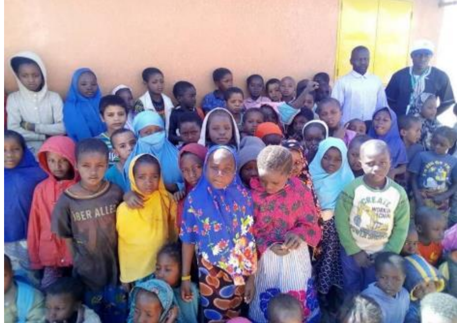
Newly enrolled Malian refugee children in Tillaberi region.

Persons internally displaced in the Tillaberi & Tahoua regions