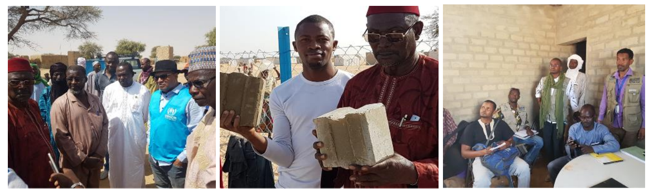
"Go and see mission of Mayors of Tillaberi communes, to Diffa region, to observe the progress of the Urbanization project (UNHCR, Jan 2019).