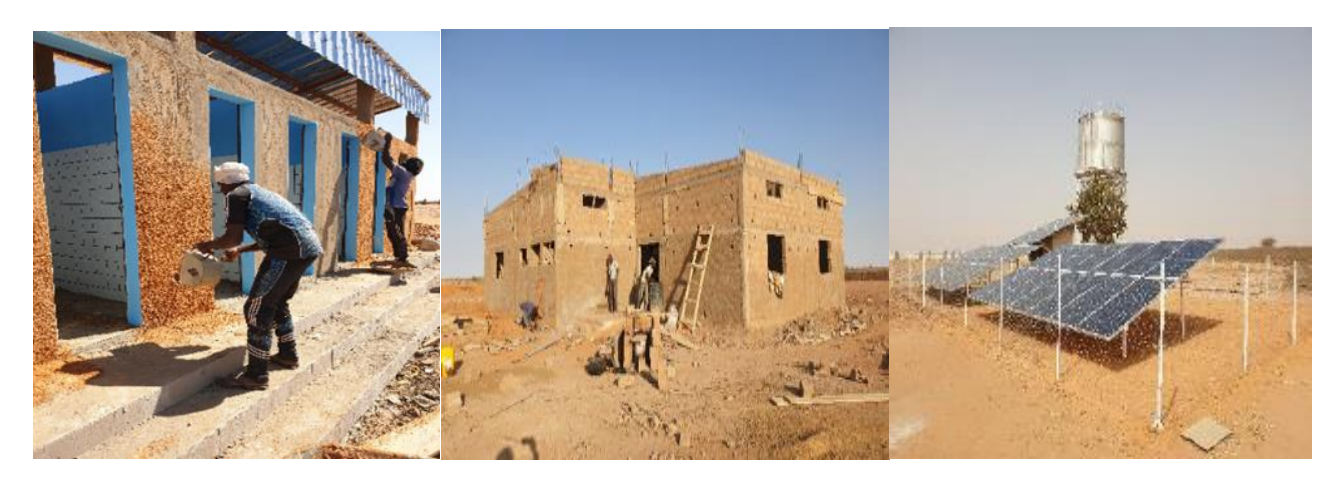
A 100m3 water tank provides water to the site but also to the neighboring villages with the help of a solar pump at the ETM transit centre in Hamdallaye (UNHCR, Jan 2019).