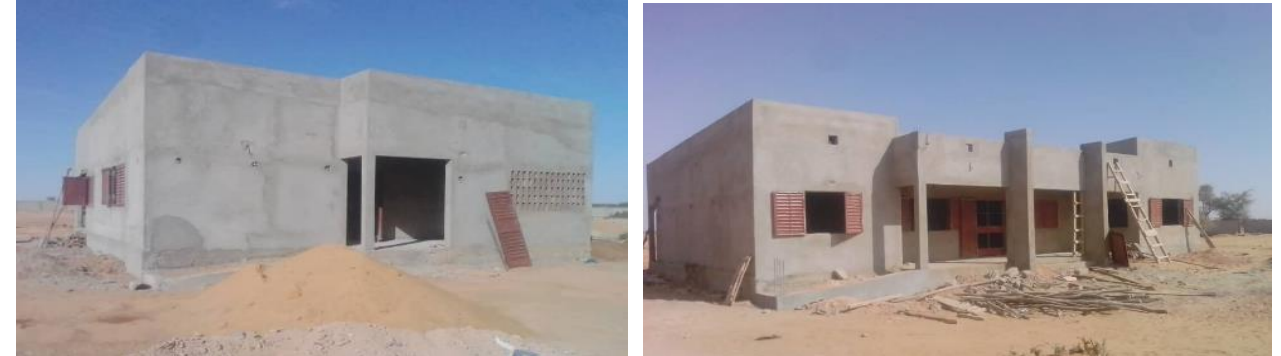
Curative ward and Maternity ward in Abala

Health infrastructure improvement is ongoing in the Tillaberi and Tahoua regions which will benefit both refugees and host population, including the construction of 2 CSI Type II health centres for the Abala (73% complete) and Ayorou (70% complete) urbanized sites, as well as strengthening of the existing CSI at Intikane.