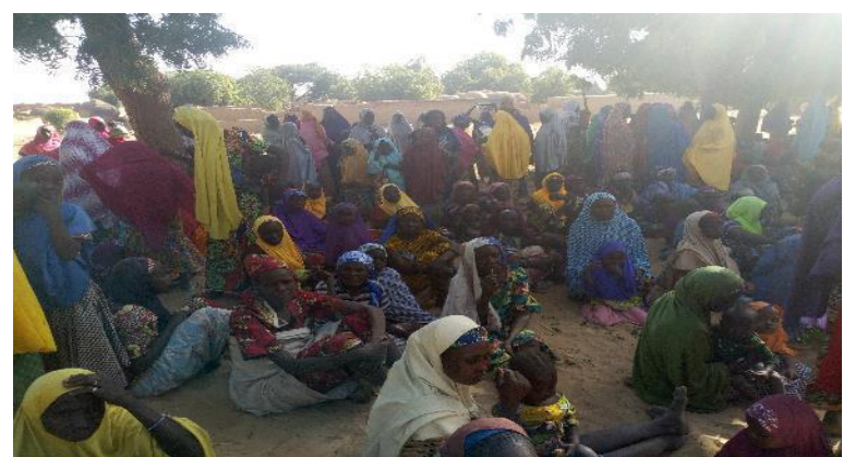
Displaced women coming from the border areas of the Zanfara State in Nigeria, (UNHCR, Jan 2019).