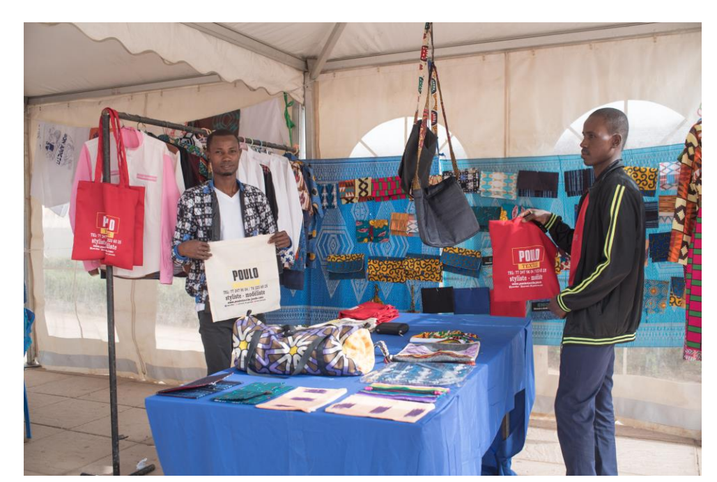
Refugees display their traditional artifacts on 20 June, World Refugee Day