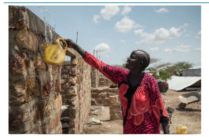
A refugee woman involved in water curing of her house in Kalobeyei settlement. UNHCR has rolled out the first cycle of CBI for shelter in which 200 refugee families have started the construction of their permanent homes.