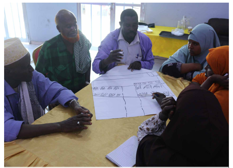
Settlement planning group activity during a capacity building training held by NRC in Mogadishu / NRC August 2018

The first service mapping exercise of Galkayo was conducted. Information on humanitarian service delivery was collected for 71 IDP sites (37 IDPs in North and 34 IDPs in South).