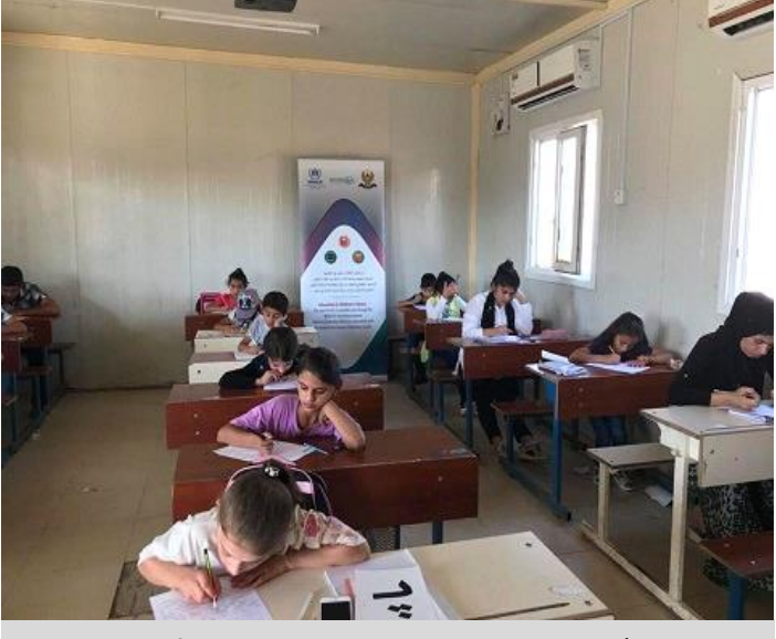
Evaluation test for students attending catch-up classes in Erbil city.

• Humanitarian partners supported the Directorate of Education (DoE) of Sulaymaniyah to provide transportation to 935 refugee children in 7 schools through hiring of 25 buses.