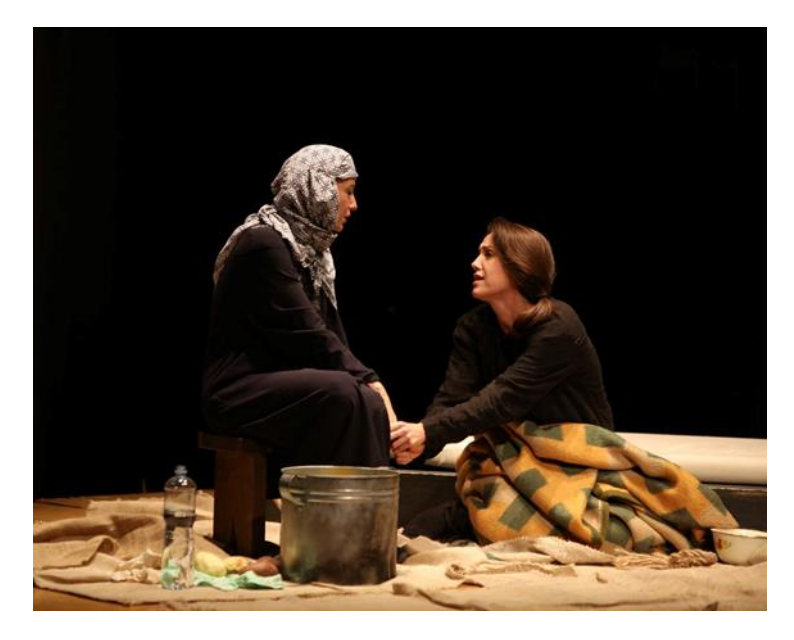
Play "If Only I was not a Woman", based on an Afghan refugee story, Belgrade National Theatre @IAN, 26 June 2018