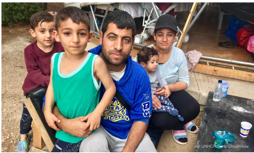
A Syrian Kurdish family from Kobani at the volunteer-run centre of PIKPA in Lesvos.