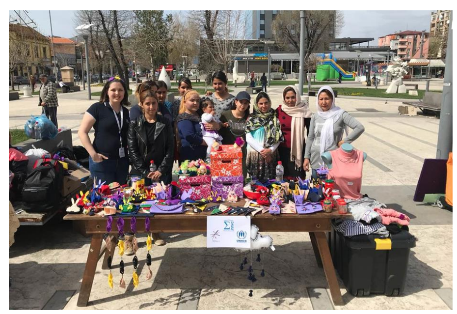
Refugee women from Pirot Reception Centre displaying their handiwork at Easter Bazaar in Pirot