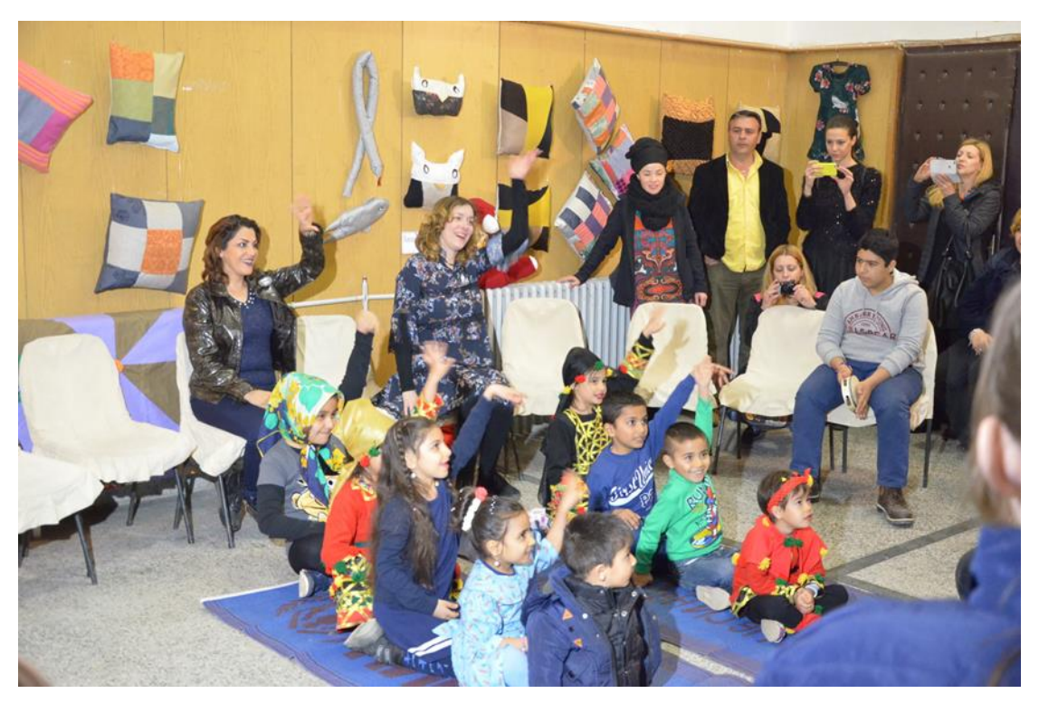
Refugee women and children attending an event at Cultural Centre Bosilegrad