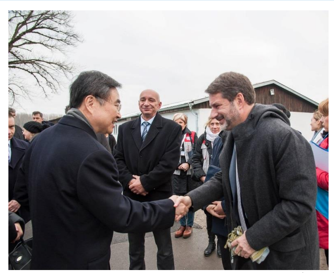
Visit of Mr. Cho Hyun, Vice Minister of Foreign Affairs of the Republic of Korea to Krnjaca AC, (Serbia), UNHCR@05 Dec 2017