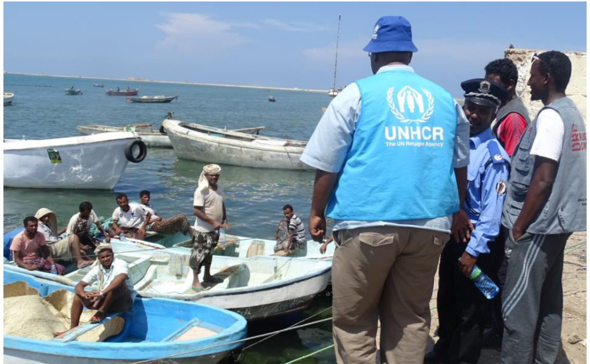
A UNHCR staff at the Port in Berbera upon arrivals of Yemeni refugees to assess the situation and assist new arrivals with the initial help.