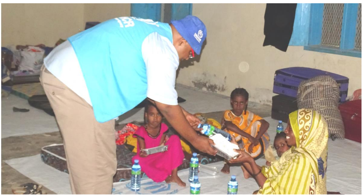
A UNHCR staff providing hot meal and water to Somali returnees at the Reception Centre at the Port in Berbera. © UNHCR/Berbera, October 2017