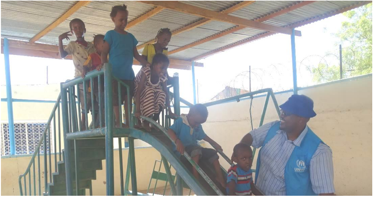
A UNHCR staff taking care of wellbeing of the Somali refugee returnees while waiting for further assistance by UNHCR at the Reception Centre in Berbera. © UNHCR/Berbera, October 2017

■ In October, UNHCR provided access to health care services to 1,348 Yemeni refugees, 1,266 in primary and 82 referrals to secondary and tertiary health care services.