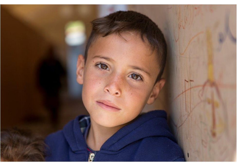
A Syrian boy in the Samos island Reception and Identification Centre of Vathy. September 2017