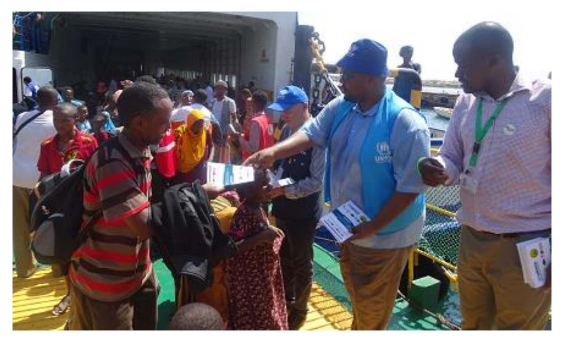
Somali returnees supported under the Assisted Spontaneous Return receiving leaflets on services available while disembarking at the Port in Berbera. © UNHCR / September 2017