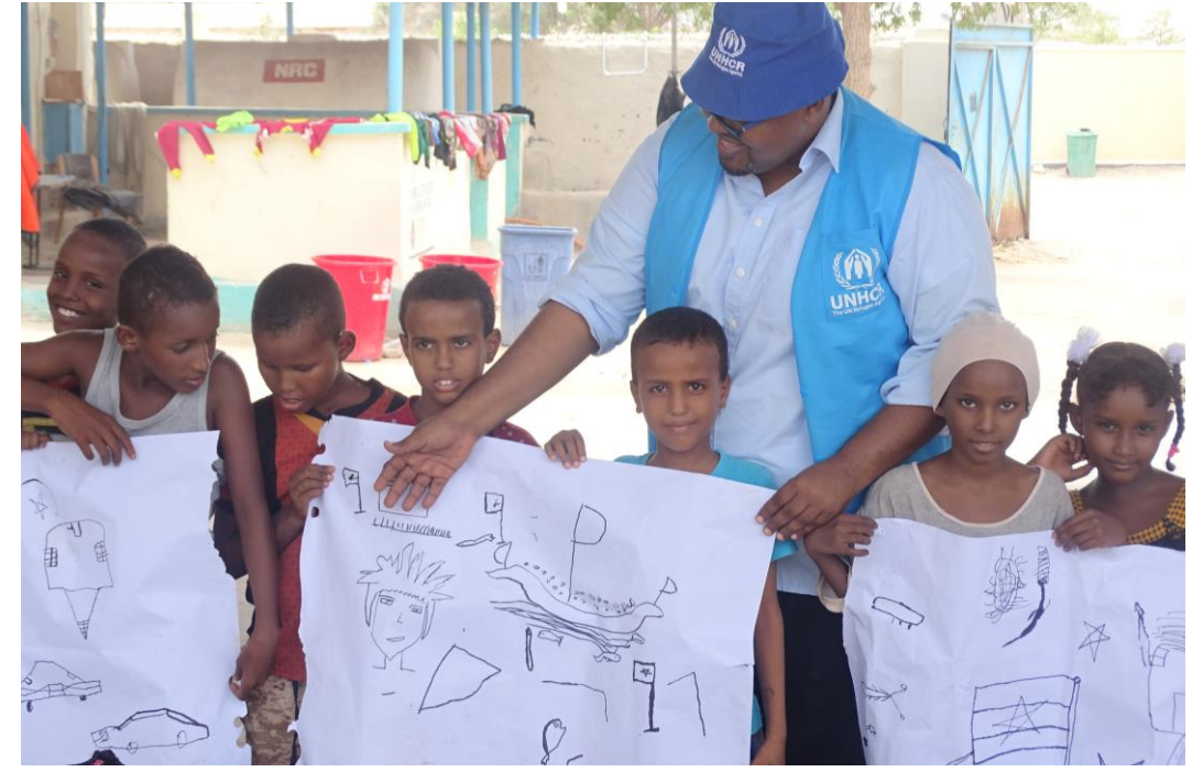
In Berbera, a UNHCR staff together with the Somali returnees. Returnee children draw pictures of their journey from Yemen to Somalia.