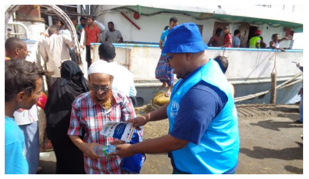
A UNHCR staff provides to a new arrival water and a leaflet on services available in Somalia. Port in Berbera, August 2017