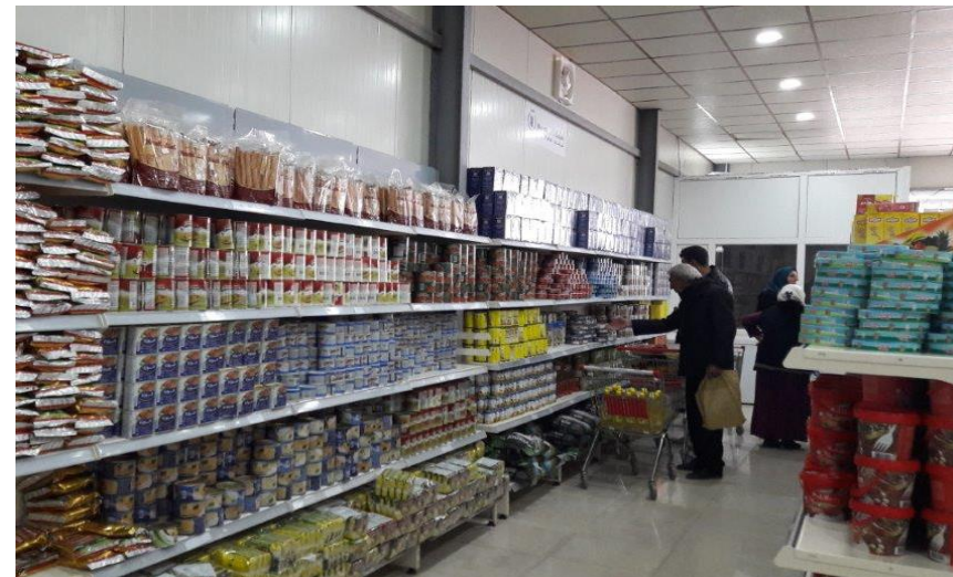
Syrian families in Sulaymaniyah use their SCOPECARDS to buy items from the camp shop

WFP faces a net funding requirement of USD 14.2 million for the refugee operation in Iraq over the next six months.