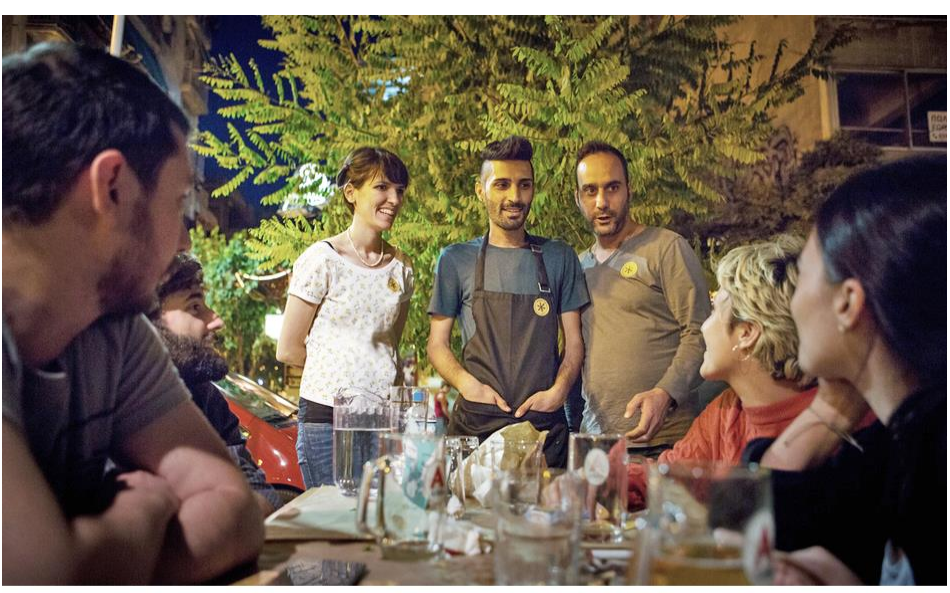
2017 Refugee Food Festival at Seychelles Restaurant, Greece.