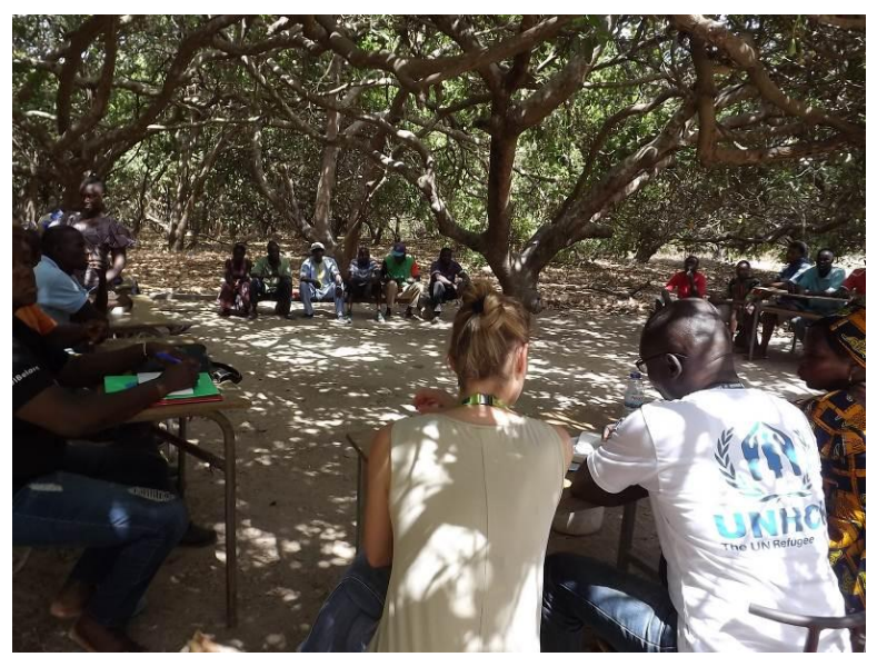
Community meeting held in April in Soungutoto.