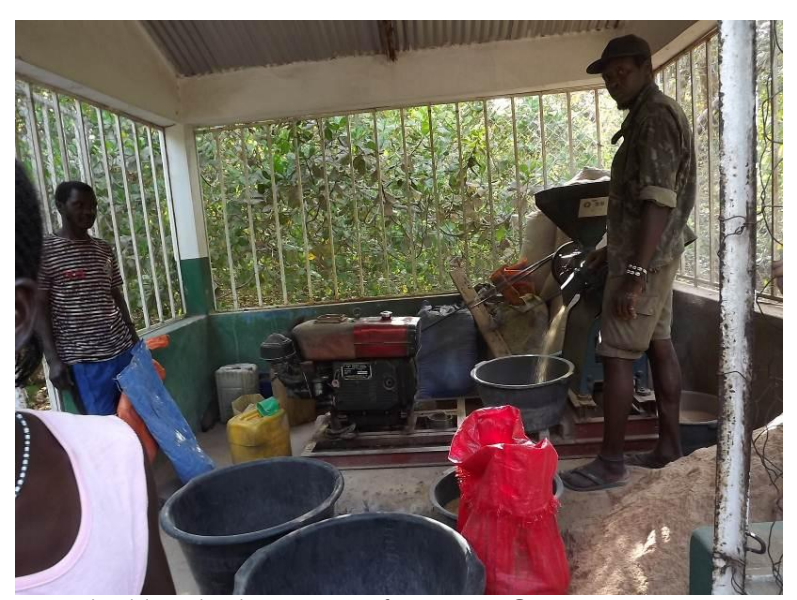
Rice-Husker delivered to the Community of Barraca Biro.