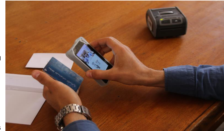
All assistance is provided through the SCOPE platform

Food remains a top priority, with families spending more of their money on food than anything else. Beneficiaries are still frequently buying food on credit and consider it a main income source, which may affect their longer-term ability to cope, though this has decreased since the previous FSOM.