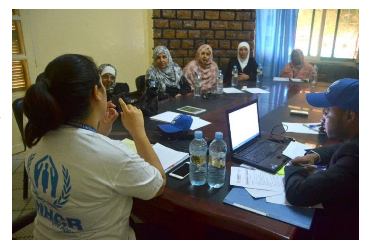
UNHCR staff meet with Syrian refugee women during a focus group discussion in Nouakchott.

on an equal footing and are able to participate fully in the decisions that affect their lives and the lives of their family members and communities. This year, focus groups discussed themes such as "refugee documentation", "self-reliance", "access to health" and "education" More than 290 urban refugees and asylum seekers actively participated in consultations in Nouakchott and Nouadhobou as well as more than 500 Malian refugees in Mbera camp.