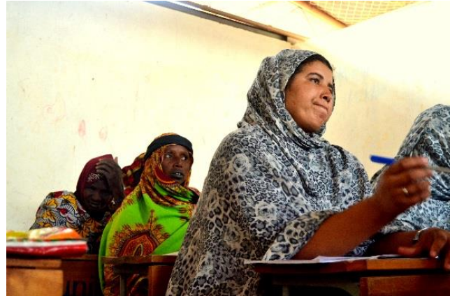
Adults attend literacy classes in their own language in Mbera refugee camp.