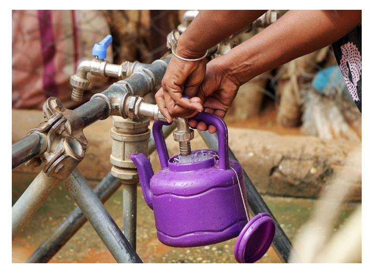
Water quality in Mbera camp is assured through regular tests to prevent the spread of waterborn diseases.

up campaigns to raise awareness on water and sanitation and prevent the spread of waterborne diseases.