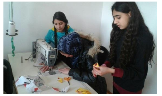
NSHC sewing course in Adasevci Transit Centre, Adasevci (Serbia) UNHCR @13 Feb 2017

UNHCR and partners provided life-saving aid, counselling, support to registration with the police, as well as referrals to child protection and medical services in the city centre.