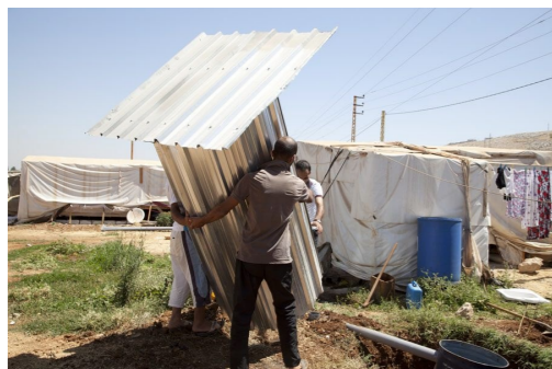
Partners installing latrines in one Informal Settlement

- hygiene promotion is approaching 75% of the end of year target. However the area needs to be significantly re-scaled and reinforced to answer to hygiene needs.