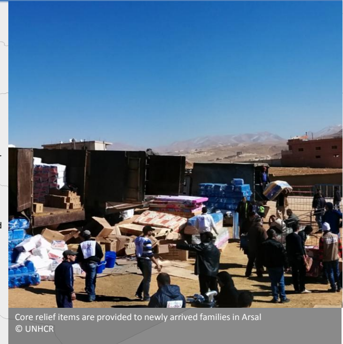
Core relief items are provided to newly arrived families in Arsal