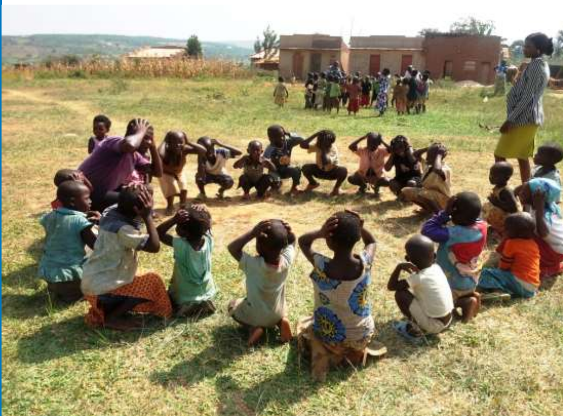
Children of Burundian arrivals participating in physical education at one of the ECD centres in Nakivale Refugee Settlement.